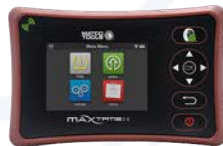
Matco MAXTPMS 2.0