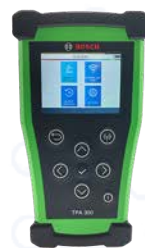
Bosch TPA 300