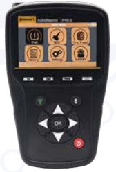
Continental TPMS D