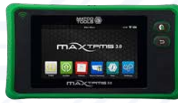
Matco MAXTPMS 3.0